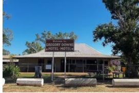
GREGORY DOWNS HOTEL