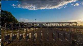
GREGORY DOWNS JOCKEY CLUB